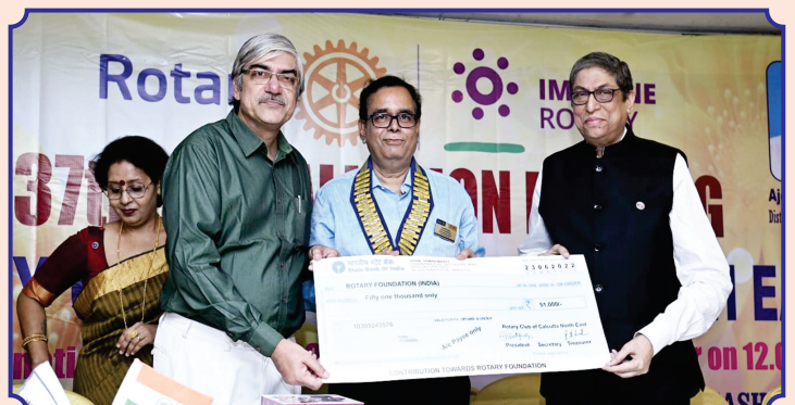
Contribution towards Rotary Foundation