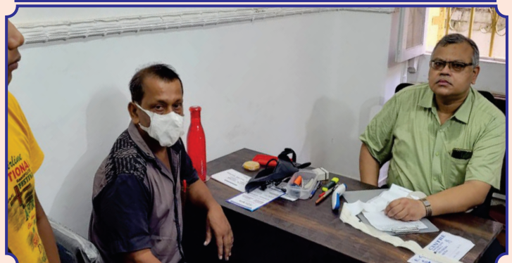
Project Ujjivan : Sunday Medical Clinic